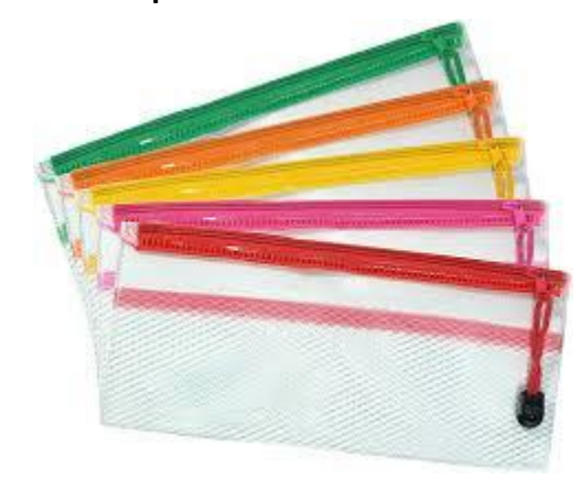
Use of a CLEAR pencil case/Ziplock bag Remove ALL notes and pieces of paper