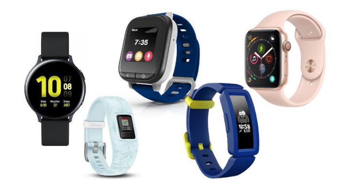
NO smartwatches NO fitness trackers