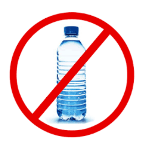
NO drinking during the entire duration of the examination